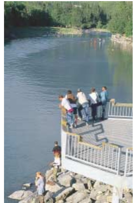
Spectators watch anglers from observation deck at Bird Creek.

S 101.2 A 25.8 Bird Creek fishing access to east; campground to west. Bird Creek