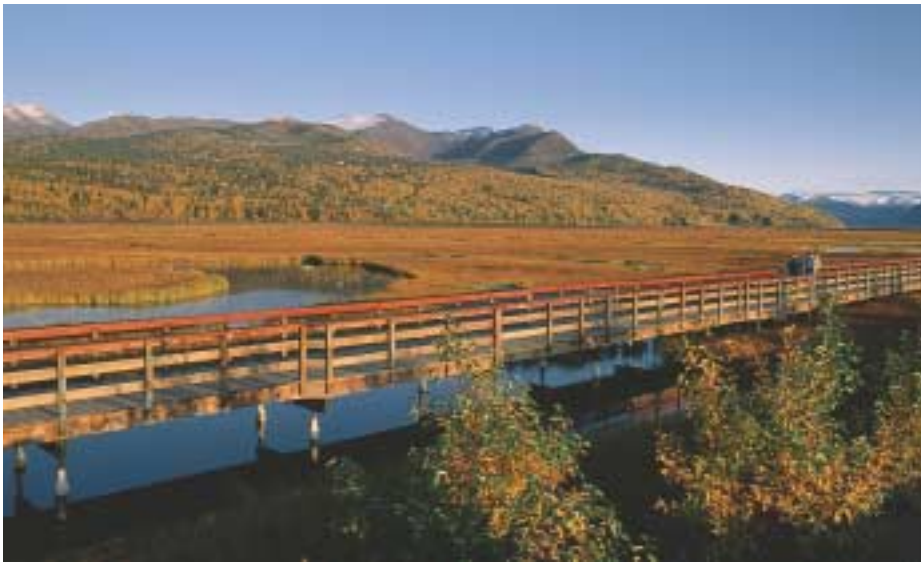
The boardwalk at Potter Marsh, Milepost S 117.4, is an ideal spot for bird watching.