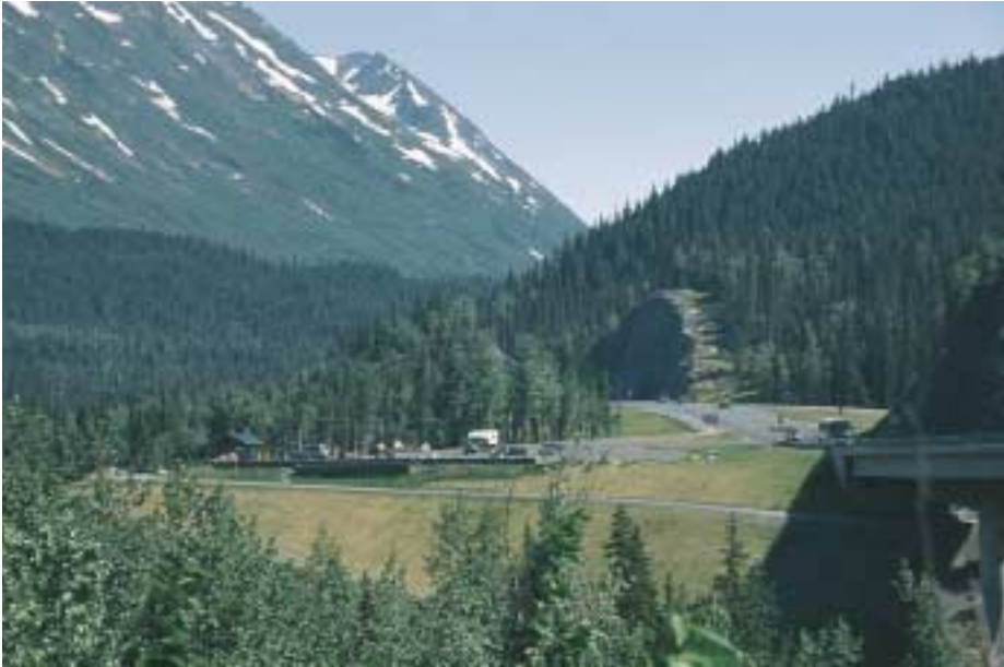
Canyon Creek rest area near the Hope Highway turnoff on the Seward Highway.