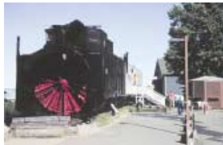
Chugach State Park Headquarters is housed in the historic Potter Section

A vintage snowplow train and interpretive panels on the railroad are on display on the grounds here.